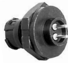
P/C Tail Panel Mount 172XX-XXB-XXX Matching Mates: • Cable Pin 1628X-XPB-XXX • Cable Socket 1628X-XSB-XXX