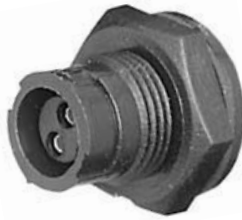
Panel Mount 1728X-XXB-XXX Matching Mates: • Cable Pin 1628X-XPB-XXX • Cable Socket 1628X-XSB-XXX