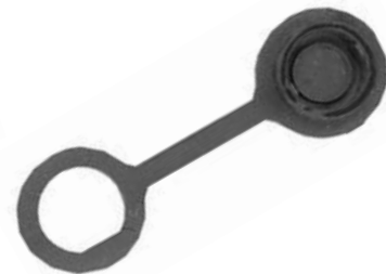
Dust Cap 16295