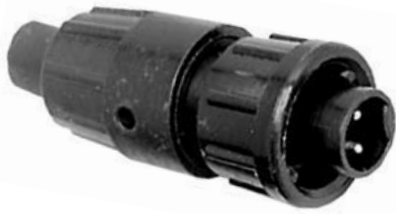
Cable Pin 1628X-XPB-XXX Matching Mates: • Cable-Cable 1828X-XSB-XXX • Panel 172XX-XSB-XXX